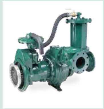
Typical Pump Configuration