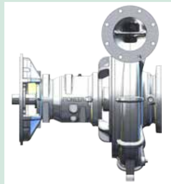
Typical Pump Configuration