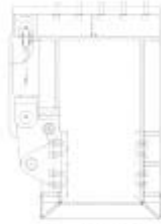
Model 85 Wood, Concrete & Pipe Clamp

Clamping force 140 tons, 1245 kN Weight 2,150 lbs., 975 kg