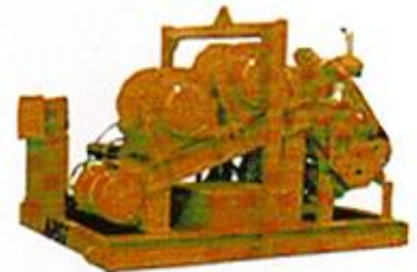
TWO DRUM WITH SWINGER WATER TOWER ERECTION HOIST