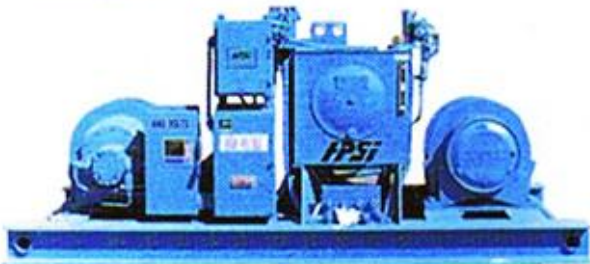
HYDRAULIC BARGE MOVER