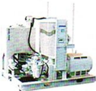
300 HP ELECTRIC POWER PACK