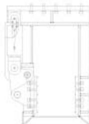
Model 85 Wood, Concrete & Pipe Clamp

Clamping force 196 tons, 1744 kN Weight 2,840 lbs, 1291 kg