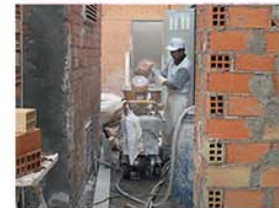
3. Easy to work in narrow spaces