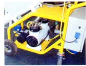
5. Air compressor 170l/min