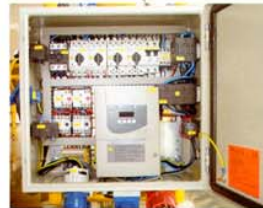
2. Electric control box. EU NORM 73/23 EU