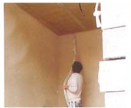
4. Plastering application