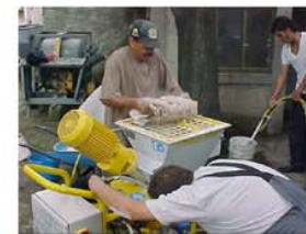
6. Convenient height for loading