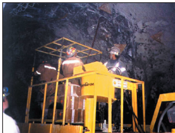
The Model 542H, shown above grouting rock bolts, is ideal for non-flowable cement grouts with water/cement ratios as low as .40 (.35 with Super "P").

Operator controls are centrally located for efficient production. All components are easily accessible for operating, cleaning and maintenance.