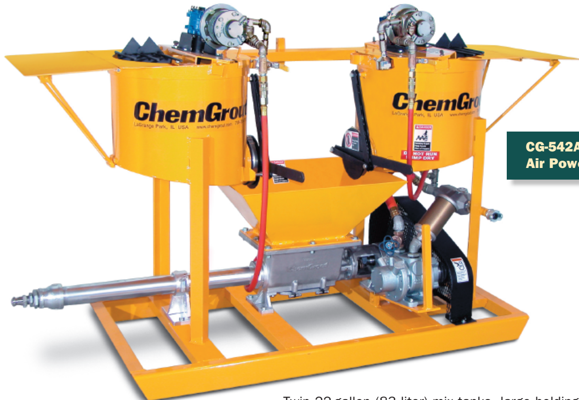
CG-542A Air Powered

Low profile, compact design is ideal for the grouting of rock bolts and cable stays in mines and tunnels