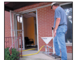
Filling Door Frame