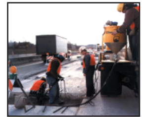
Highway Dowel Rods